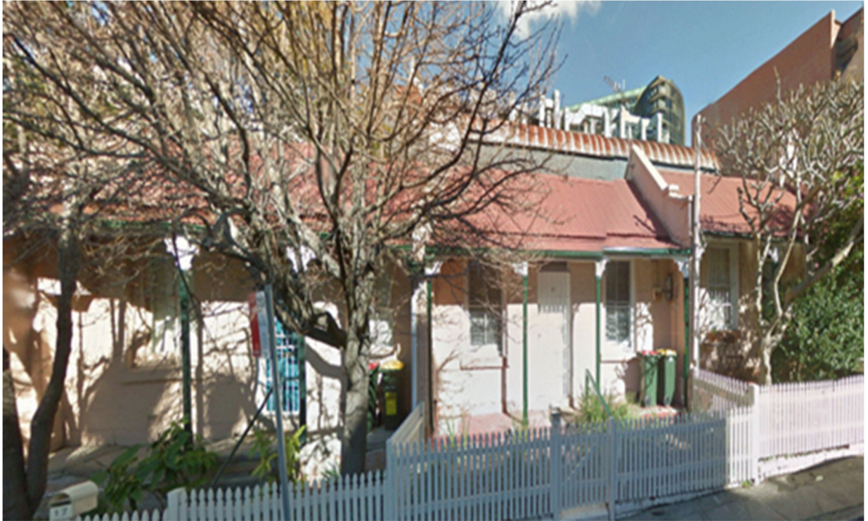
Terraces 17-11 Norman St