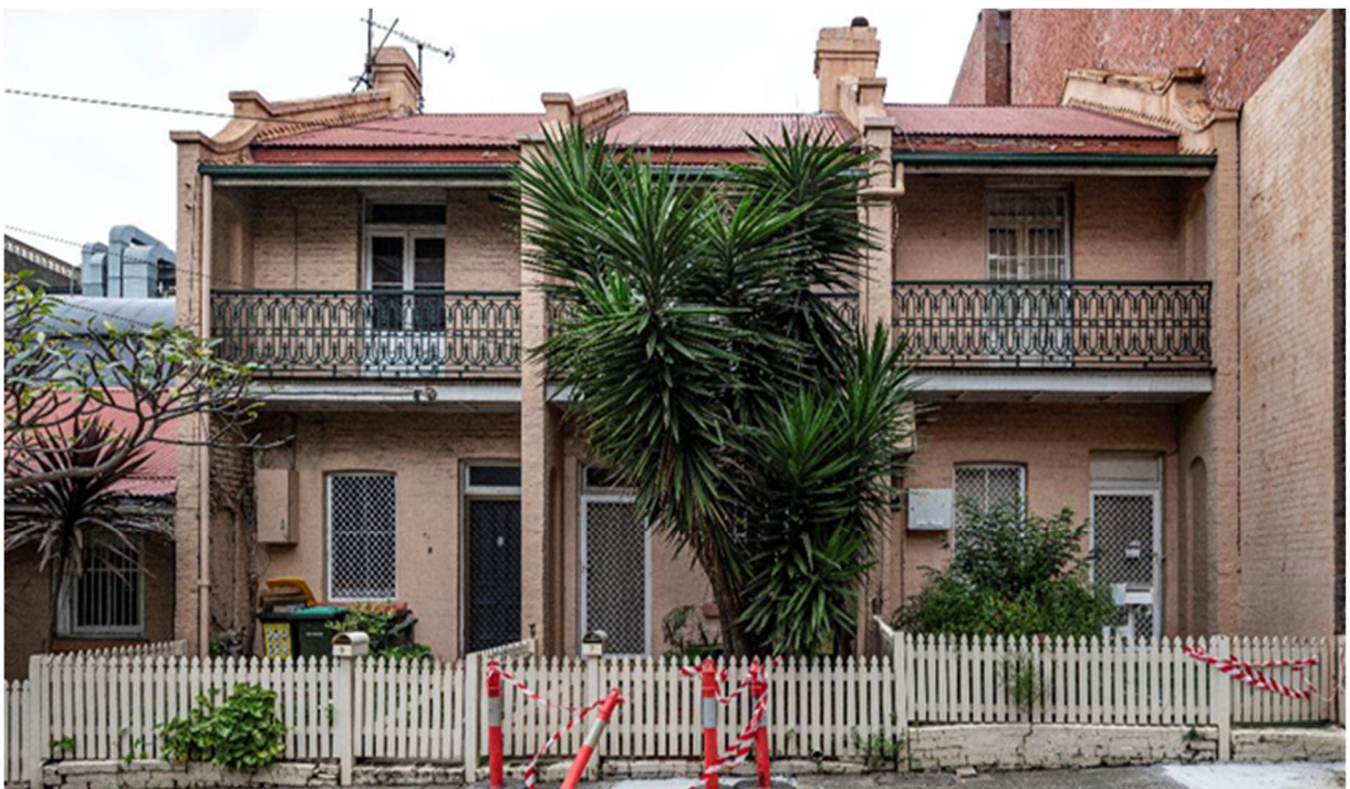
Terraces 9 - 5 Norman St